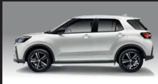
Differences from X