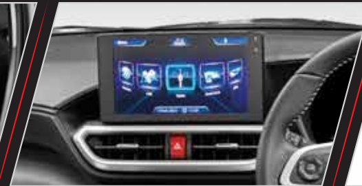
9" Display with sleek user interface