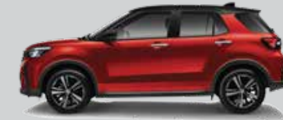
Pearl Delima Red**