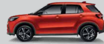
Pearl Delima Red**