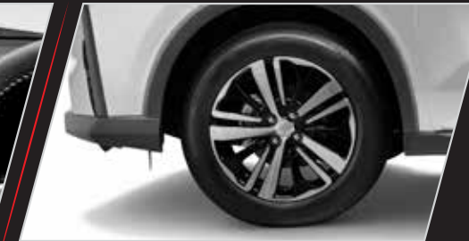
17-inch Alloy Wheels (5-spoke)