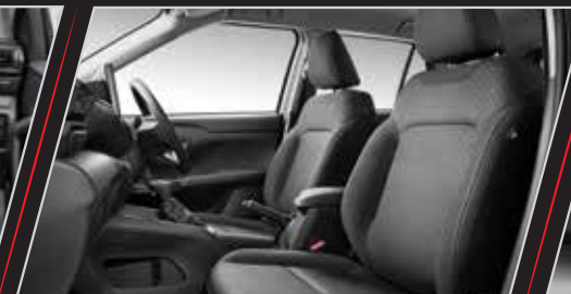
Semi-bucket Fabric Seats