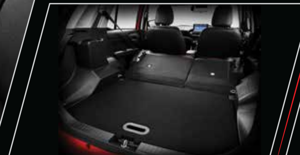
Full-flat Mode Rear Seats