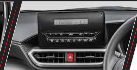
11" Radio with Bluetooth & MP3