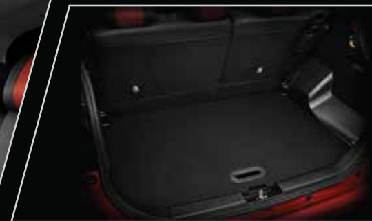
Tier 1: 303 litres