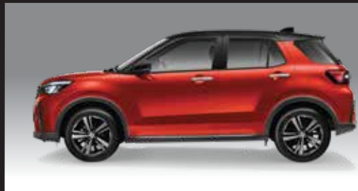
Differences from H