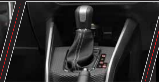
Gear Knob with Chrome