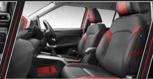
Semi-bucket Leather Seats