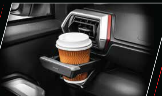
Built-in Cup Holder