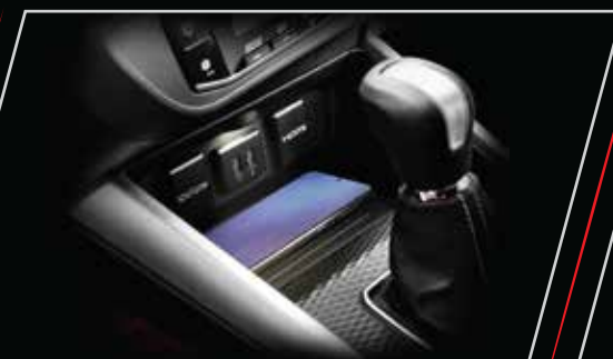
Open Tray with Illumination