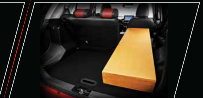
60:40 Split-folding Rear Seats