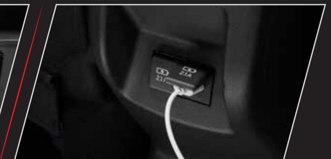
Rear USB ports*