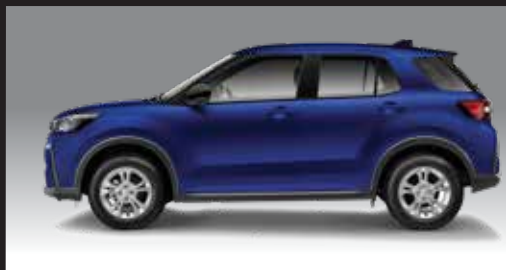
Differences from X