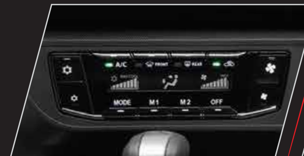
Digital air conditioner controller with quick OFF button