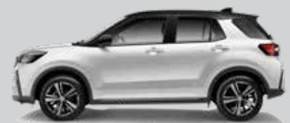
Pearl Diamond White**