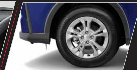
16-inch Alloy Wheels (5-spoke)