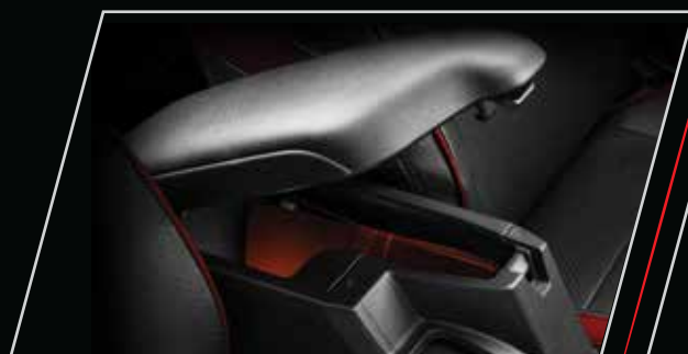
Console Box with Padded Armrest*