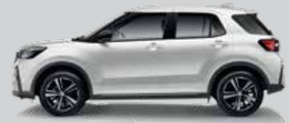
Pearl Diamond White**