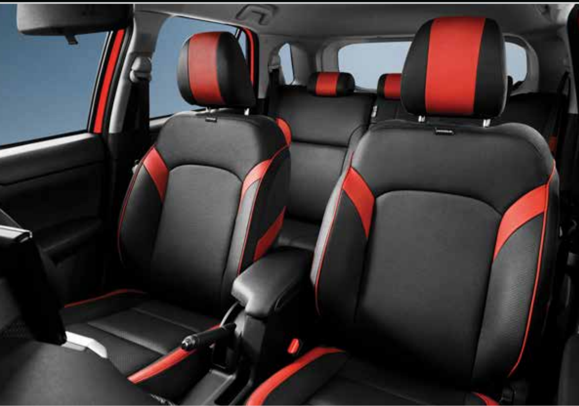
Spacious Interior for comfortable ride

Ergonomically designed to accommodate diverse requirements and needs.