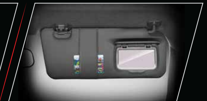
Vanity Mirror with Card Slot