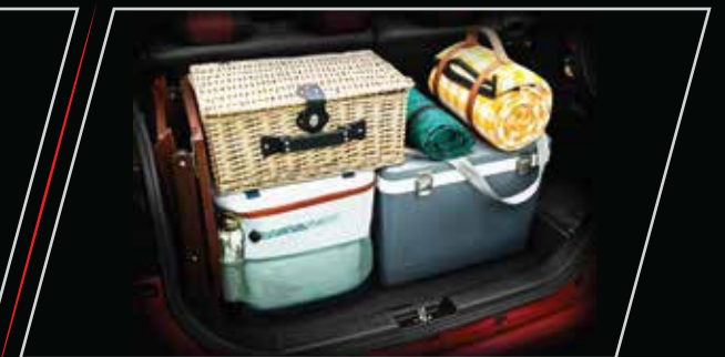
Tier 2: 369 litres